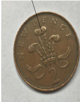
Standard 2p coin