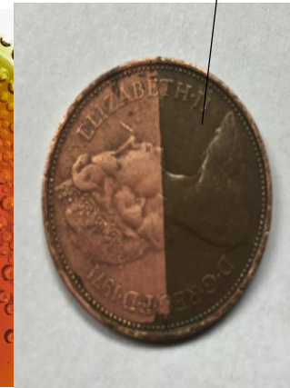
Treated half remains unaffected