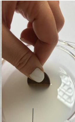
Half of coin treated